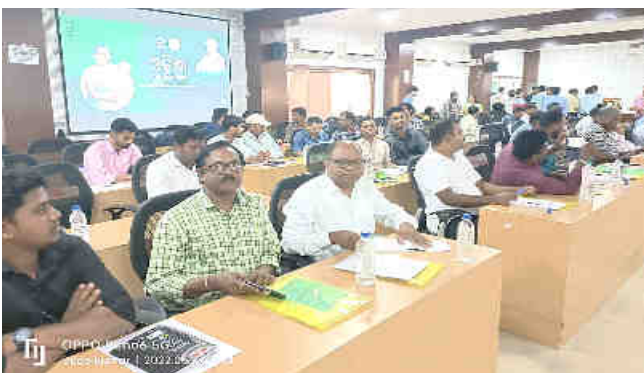
CCD Project Staff have participated in State level Orientation Training on Millets promotion with Agronomic practices and motivation to tribal farmers for regular consumption held at IMAGE, Bhubaneswar, supported by Odisha Millets Mission, Govt. of Odisha.