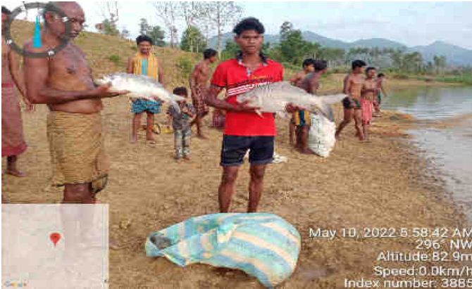
Kaveri SHG members of Kurlandaguda Village, Gumma Block caught 140 Kg of Fish in one time from 5 acres of pond. One fish was around 5 Kg and sold in market at rate of Rs. 120 per Kg. The are expecting Rs. 35000 as annual income.

1532 women SHG meetings were conducted during the quarter to capacitate the women members on savings & credit management, funds mobilization from Odisha Livelihood Mission, Mission Jeevika and other Government departments for livelihood promotion.