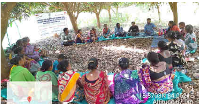
Training to Women SHG members on SHG management, Book keeping, Political participation, income generation activities, marketing and preparation of Business Development Plan.

80 % of Women members have participated in Cooperative Election Process to cast their votes to select their President of Mahendragiri Women Cooperative Society and Gajapati Women Cooperative Society.